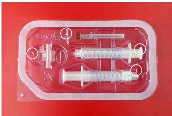
Vergenix™STR Soft Tissue Repair Device is a single use Tyvek blister kit that contains: