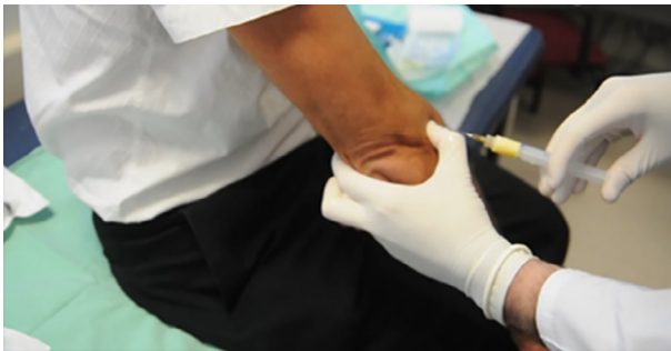
Figure 3 Injection of the Soft Tissue Repair (STR)/platelet-rich plasma (PRP) suspension to the injured common extensor tendon origin.