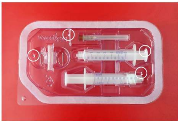
Vergenix™STR Soft Tissue Repair Device is a single use Tyvek blister kit that contains: