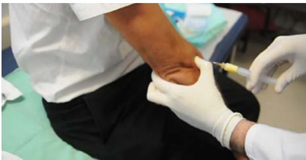
Figure 3 Injection of the Soft Tissue Repair (STR)/platelet-rich plasma (PRP) suspension to the injured common extensor tendon origin.